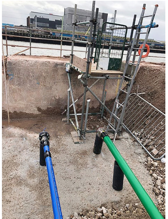
In house and onsite training was provided by OPW