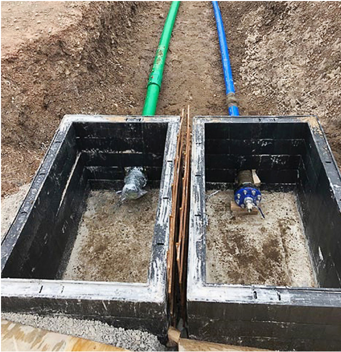
KPS piping provides a zero-permeation solution