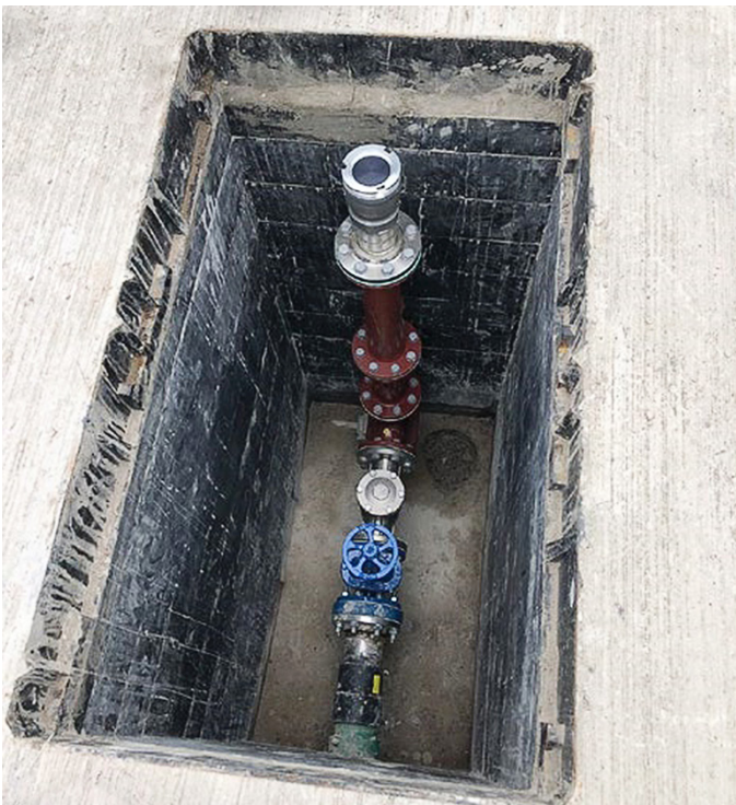
Complete below ground remote fill point