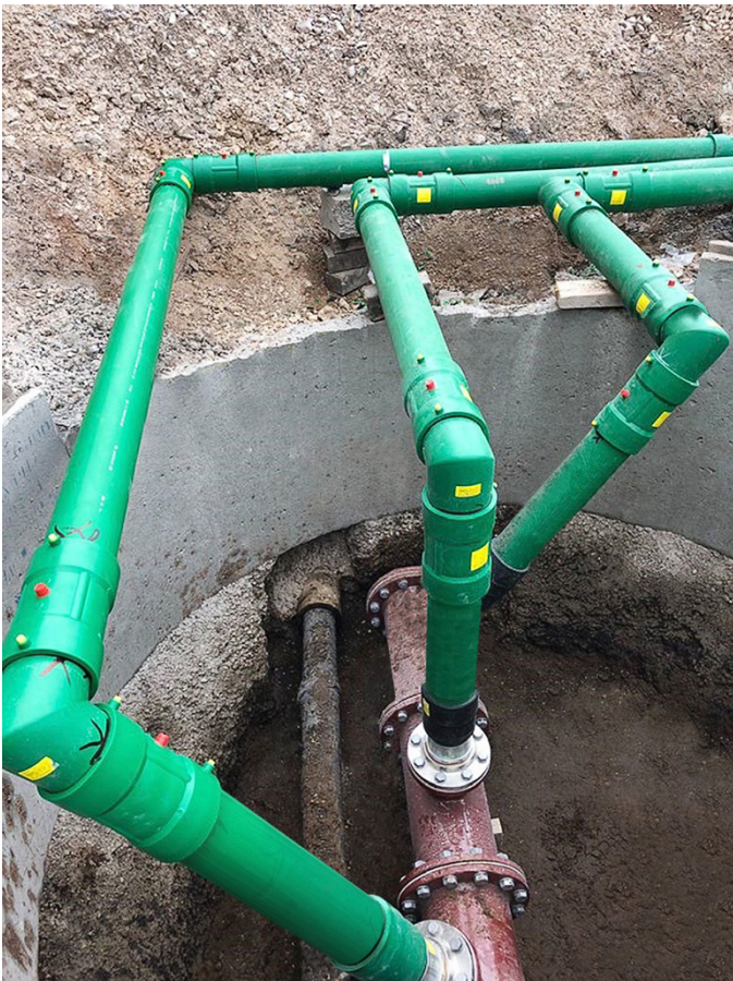
Compact moulded elbows make the join from new KPS piping to the previously installed fuel piping

Contractor Eric Wright Waters approached OPW to provide an installer friendly solution for new double wall diesel fill lines for ferries at Heysham Port, a recreational and commercial (3m tonnes/yr.) seaport in Lancashire (opened in 1904).