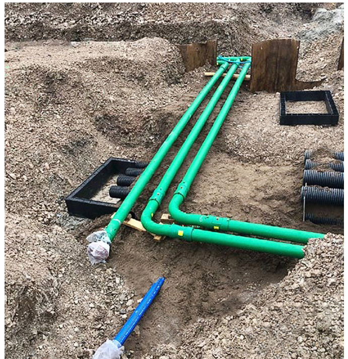
KPS double wall piping, allowing monitoring of interstitial space