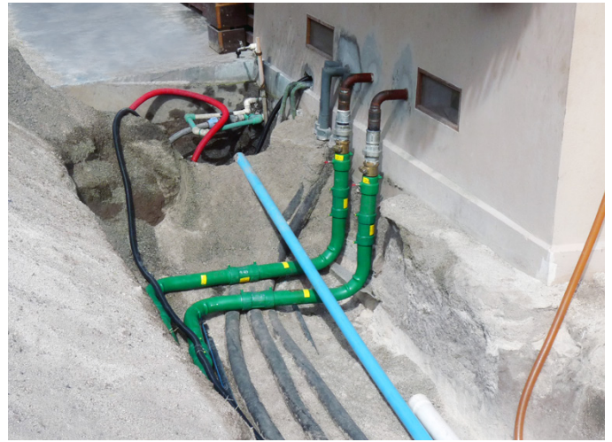
Refuelling lines running from storage point to jetty