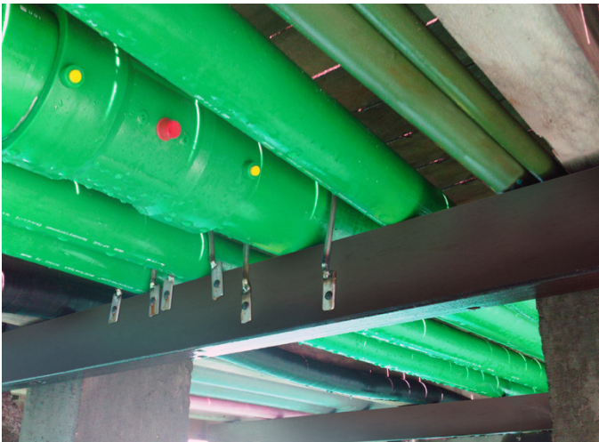
Fuelling lines run below jetty from ship to storage point

Installation went smoothly and finished on schedule. Now the island and holiday resort have a reliable discreet energy source with no danger to surrounding wildlife.