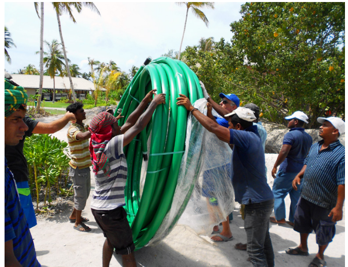
Unwrapping the KPS 75/63SCEC double wall fuel coil for the new fuel line