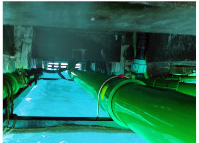
KPS piping is impervious to corrosion from saltwater

For more information on the KPS product range please contact us: