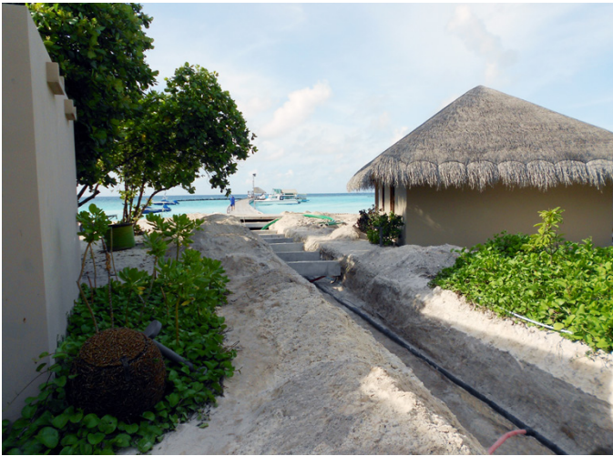
Maldives island's energy is dependent on shipped in fuel