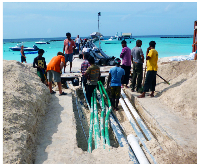
Installer friendly KPS piping allowed for quick easy installation