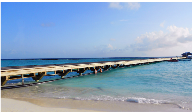
Fuel delivery jetty: piping has constant exposure to saltwater