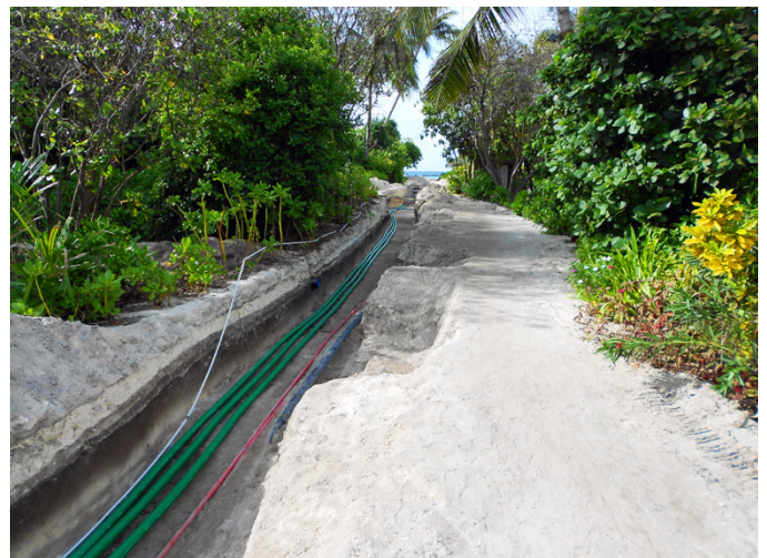
Installed piping from fuelling jetty to storage tanks ready for burial

Piping is installed on hanging mounts below jetties allow an efficient fuelling process. The double wall piping ensures no permeation of fuel into surrounding environment. KPS pipe is completely un-reactive to saltwater, eliminating the risk of deterioration with constant exposure. Conductivity ensures safe grounding in the event of sparks or static electricity generated while fuelling.