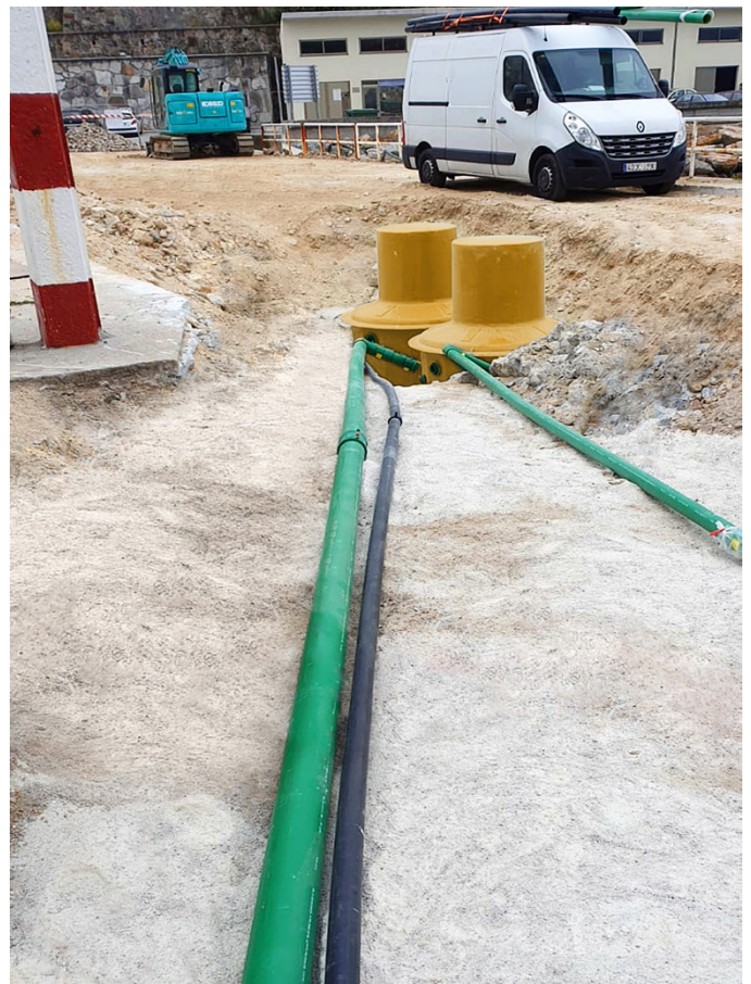
Conductive pipes avoid any static electricity build up from fuel flow