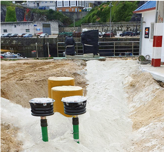
The KPS piping system is engineered for fast, simple installation