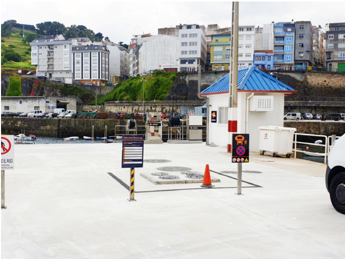
A long-term replacement for corroded metal pipework at Ondarreta, Sada and Malpica ports was needed