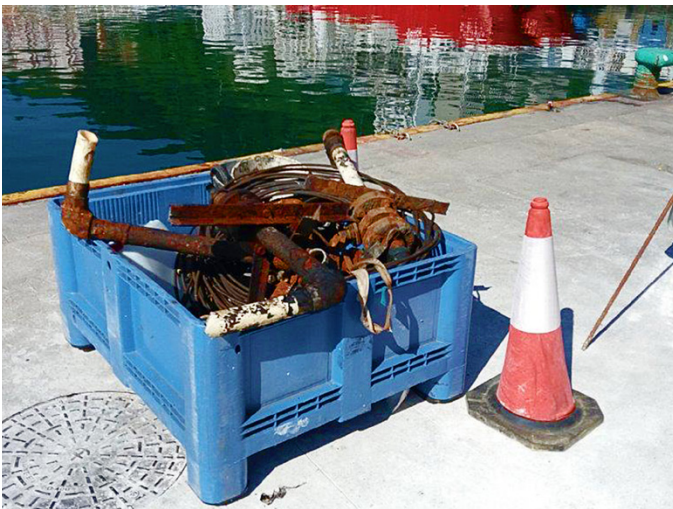
Previously installed metal piping had corroded due to the salinity of the water

REPSOL, the leading operator of fishing port fuelling points in Spain, approached KPS for a long-term replacement for corroded metal pipework at a selection of their ports.