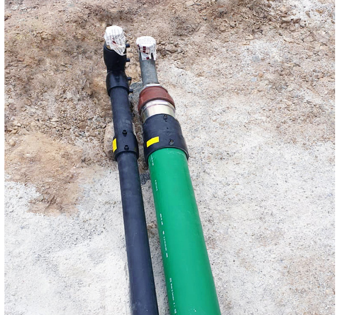
KPS' double wall pipes provide control over the interstitial space between the inner and outer pipes, meaning that a leak can be located and contained quickly

The fishing boat refuelling points in Ondarreta, Sada and Malpica ports had been installed a number of years ago, using predominately metal pipework. These were corroding due to the salinity of the water and the environment.