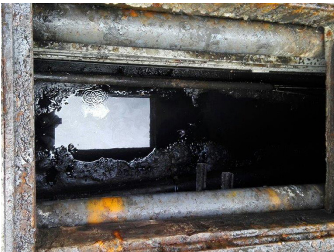
Due to the corrosion, the pipes had begun to break down