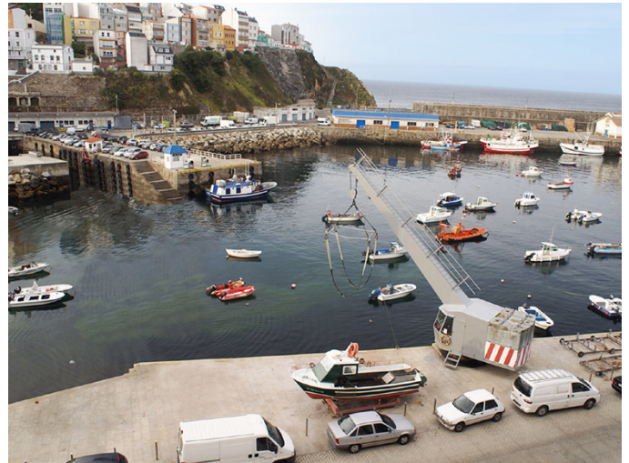
Malpica port now has a safe and reliable piping system thanks to KPS

Ondarreta, Sada and Malpica ports now have a safe and reliable piping system which will continue to perform for years to come.