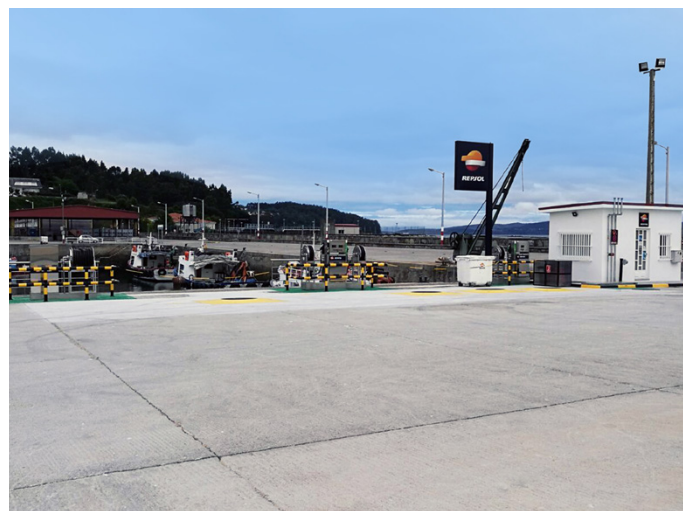
REPSOL is the leading operator of fishing port fuelling points in Spain

For more information on the KPS product range please contact us: