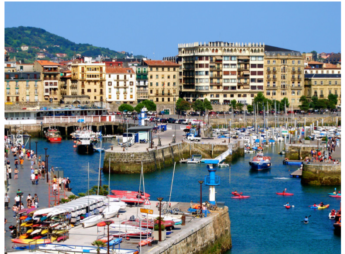
Ports Ondarreta, Sada and Malpica required KPS piping